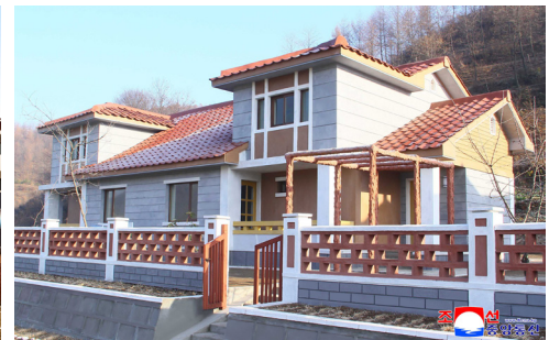
Modern houses built in rural communities across the country change their appearance for the better.