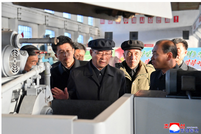
Premier Pak Thae Song (centre) inspects the Pyongyang Mining Machine Factory.