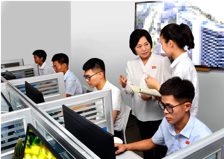
Officials of the Ragwon IT Trading Company under the Ragwon Trading Guidance Bureau care about the work of persons with disabilities.