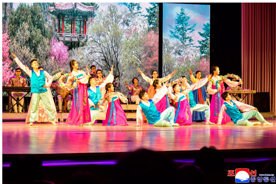
The Korean Art Association of the Disabled gives an artistic performance to mark the International Day of Persons with Disabilities.

of the disabled leading a happy life under the socialist system of the country.