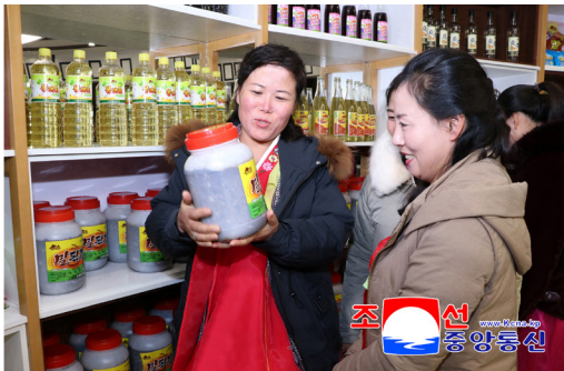
In Sinyang County, South Phyongan Province.