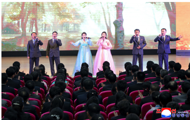
Workers and members of the General Federation of Trade Unions of Korea gather at the Central Hall of Workers in Pyongyang on December 15 to tell stories about the noble virtues of Chairman Kim Jong Il.

Among the audience were officials of the Central Committee of the GFTUK and officials and members of the GFTUK and workers in Pyongyang.