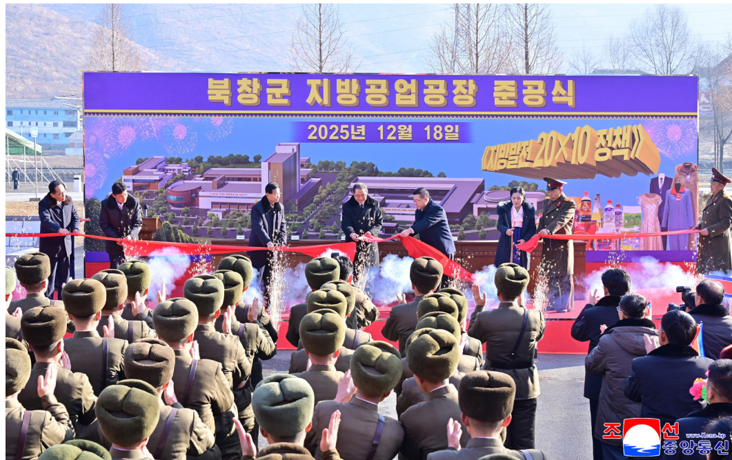
In Pukchang County, South Phyongan Province.