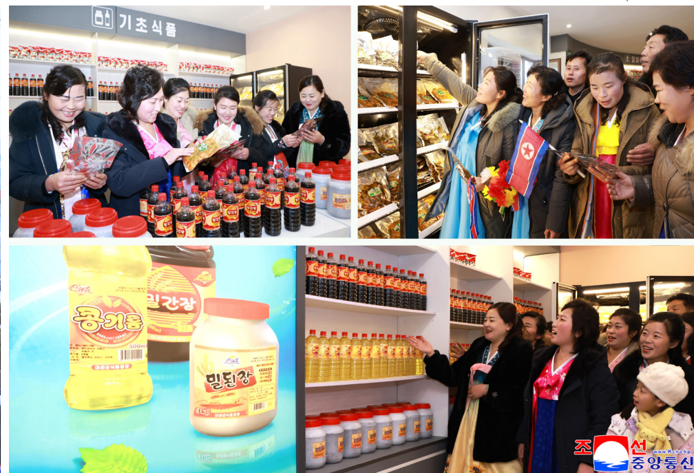
In Taegwan County, North Phyongan Province.