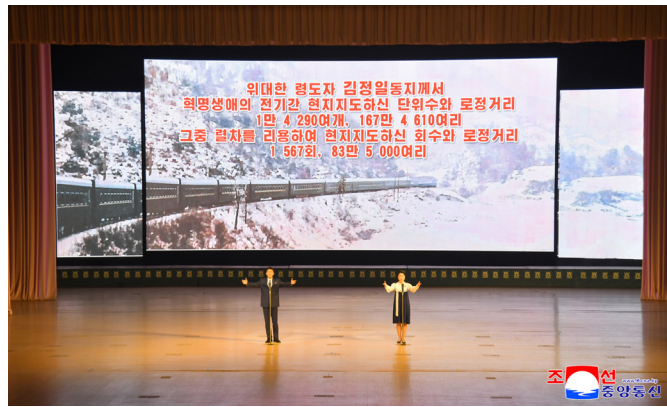
A young man and woman praise the undying exploits of Chairman Kim Jong Il at a meeting of telling stories about the Chairman's noble virtues held at the Central Youth Hall in Pyongyang on December 15.