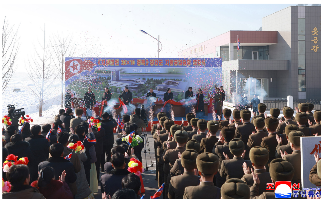
In Janggang County, Jagang Province.