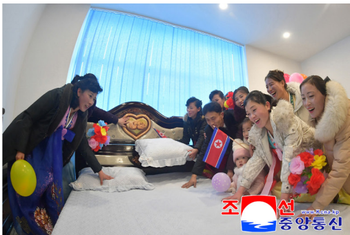
In Rangnim County, Jagang Province.