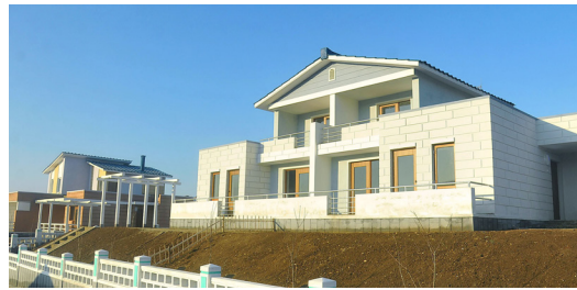
Rural communities are given a total facelift as new dwelling houses are built.