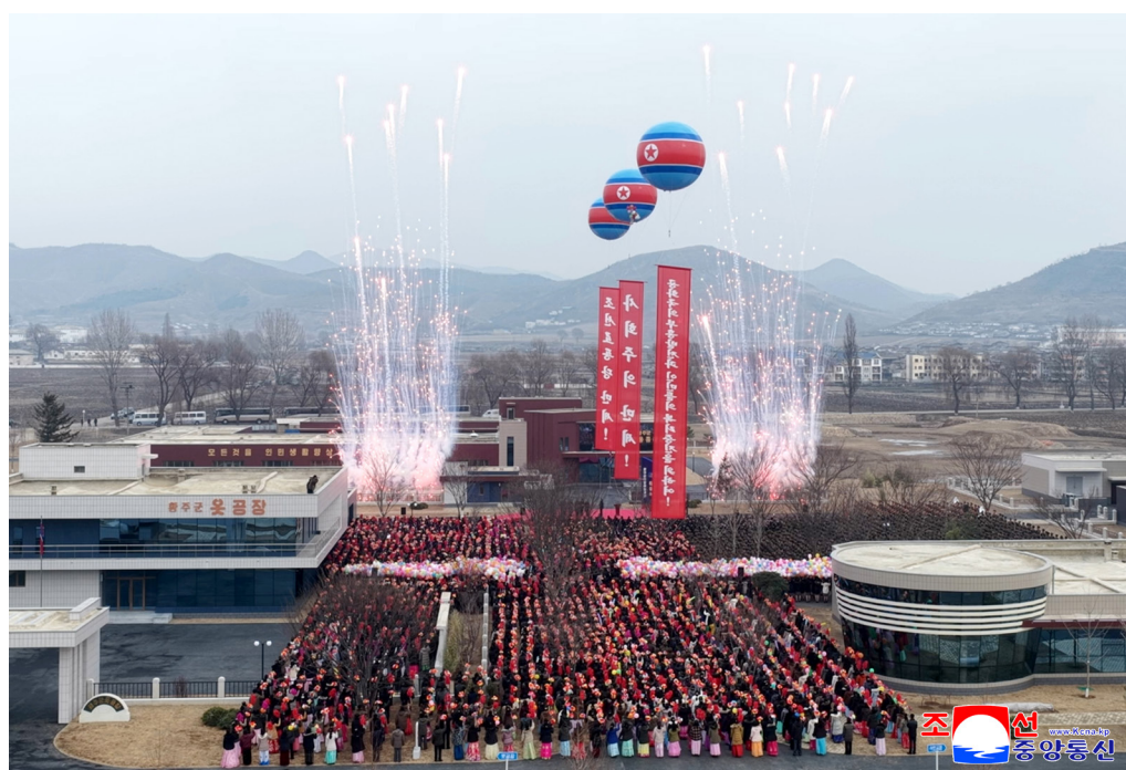
In Hwangju County, North Hwanghae Province.