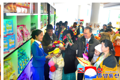
In Puryong County, North Hamgyong Province.