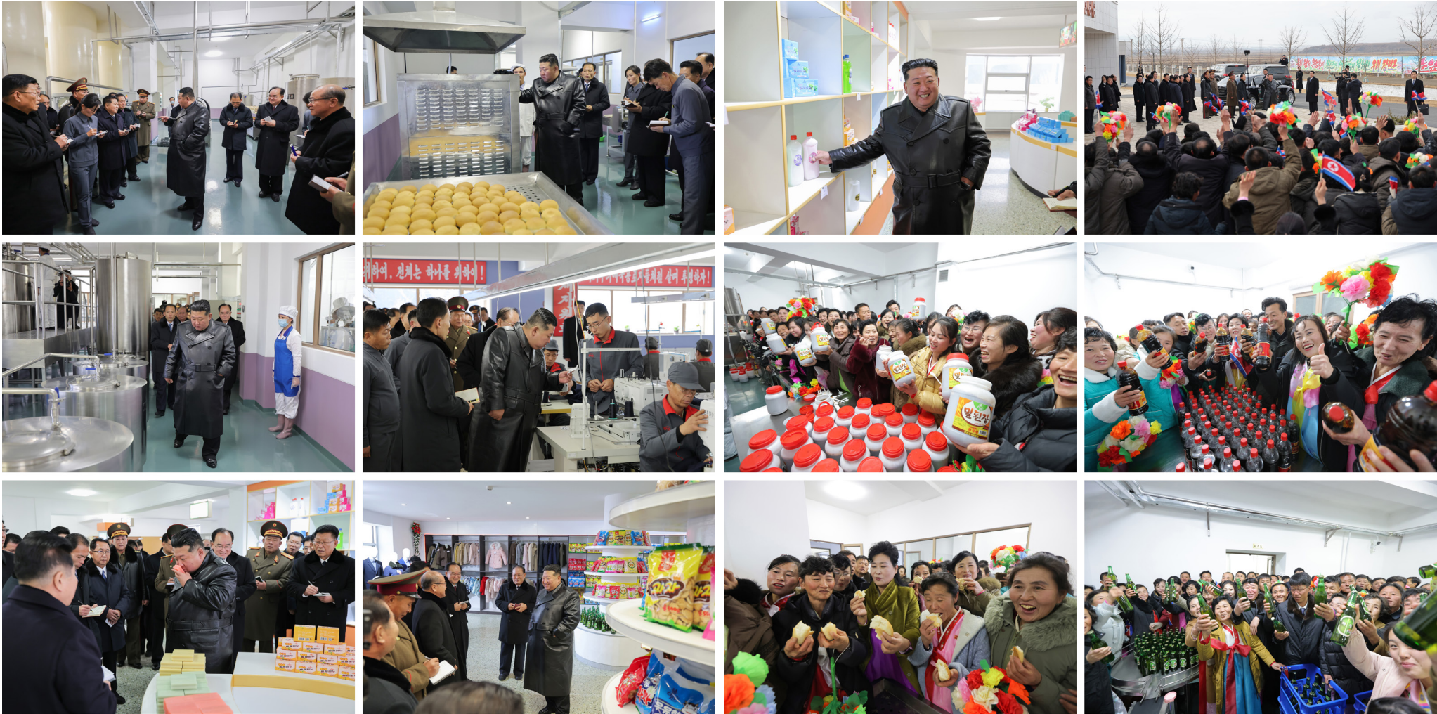
FROM PAGE 7

forward to a higher stage, the speaker said that under his outstanding leadership, the regions accounting for one-tenth of the country came to have solid foundations for independent development last year and those making up one-fifth this year already.