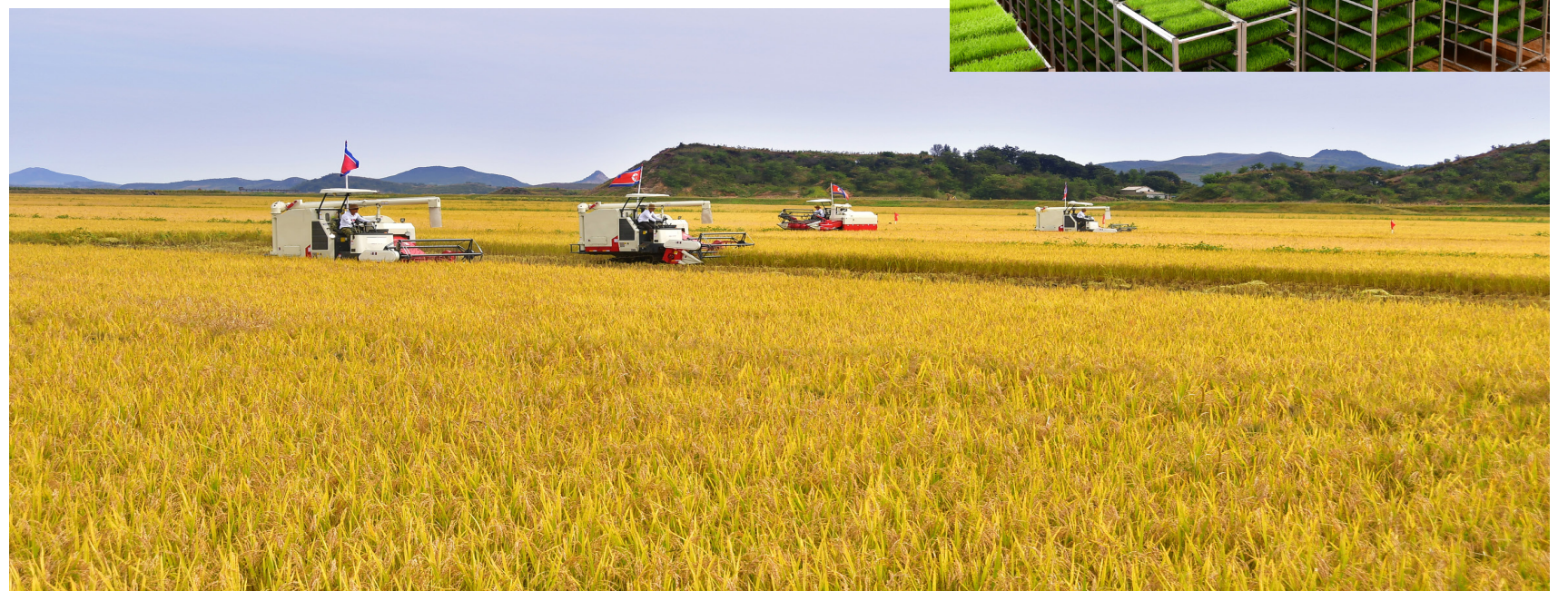
Farms across the country produce high yields by introducing advanced farming techniques including the raising of healthy rice seedlings in greenhouses.