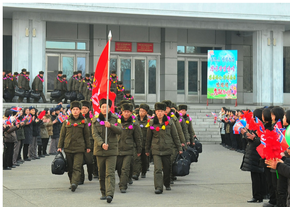
Young people volunteer to work at the Ansok Farm in Onchon County of Nampho Municipality.