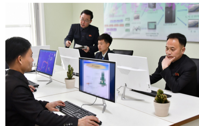
Researchers analyse data on forest resources at the forest survey and analysis institute under the Academy of Forest Science.