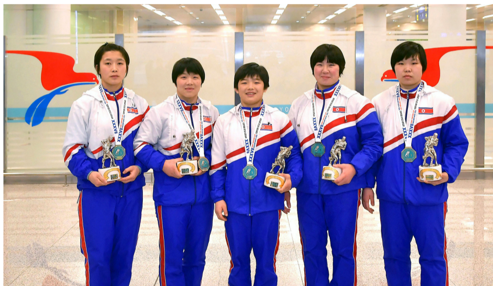
The DPRK women wrestlers win gold medals.