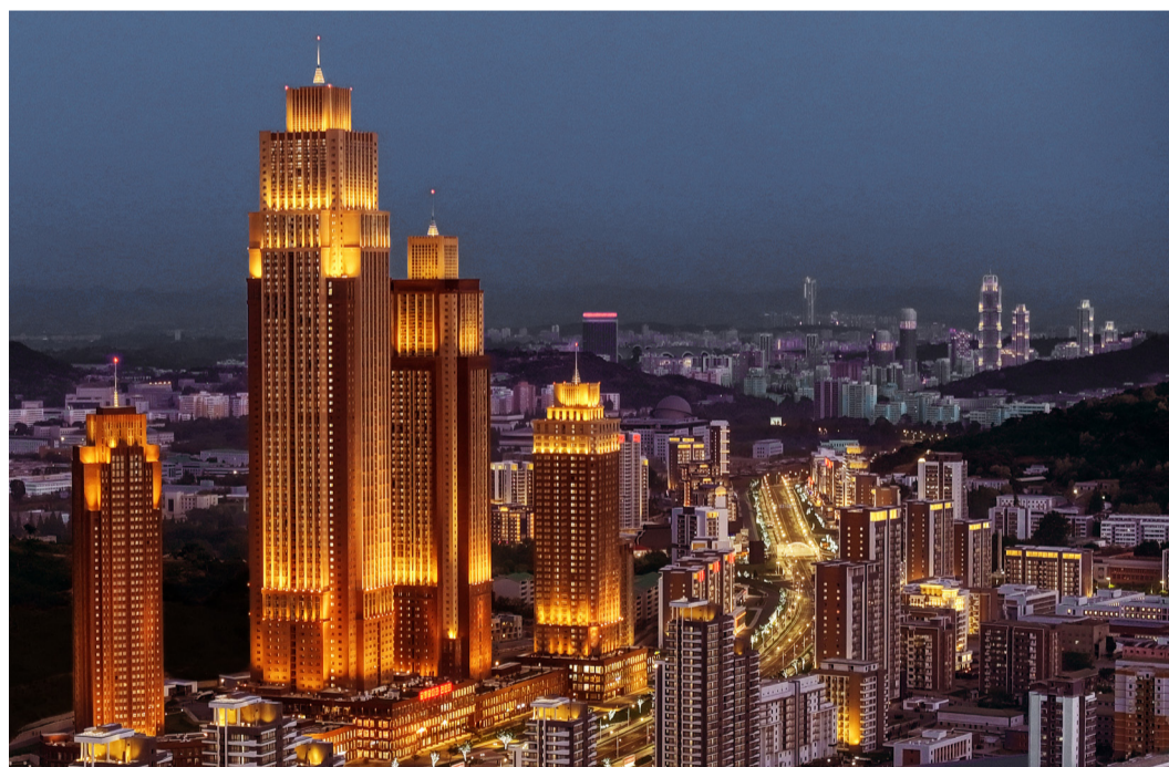
Jonwi Street built by young people (2024).

The respected Comrade Kim Jong Un personally pinned the order of glory on the flag of the SPYL.