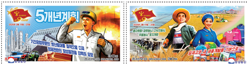
Newly issued stamps.

There are also stamps reflecting the intention and idea of the WPK that more vigorous struggle should be waged for the development of science and technology and socialist culture and the building of powerful national defence capabilities.