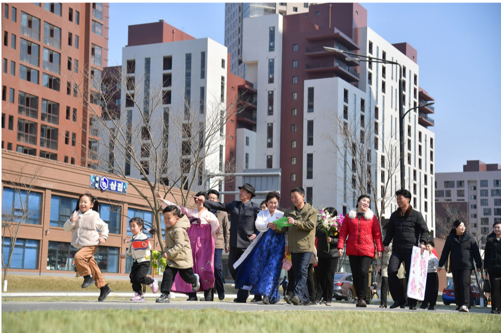
People move into the fourth-stage 10 000 flats in the Hwasong area day after day.

The flats of families of discharged officers and educators, families with many children and other families were full of boundless gratitude to the motherly Party, which brings the people greater joy, louder laughter and deeper happiness, and the resolve to work harder for the prosperity of the country with loyalty and patriotism.