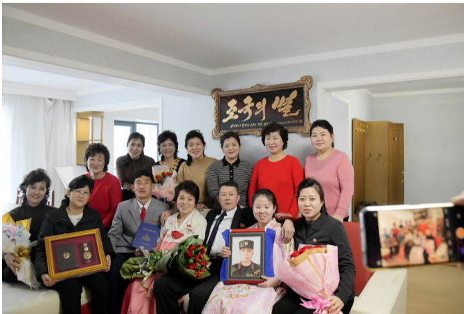
The bereaved families of the combatants who participated in the overseas military operations move into new flats on Saeppeol Street in Pyongyang.

The senior officials presented bouquets to the bereaved families moving into new flats and warmly congratulated them. They also told about the love and benevolence of the respected Comrade Kim Jong Un who greatly values the bereaved families, who became