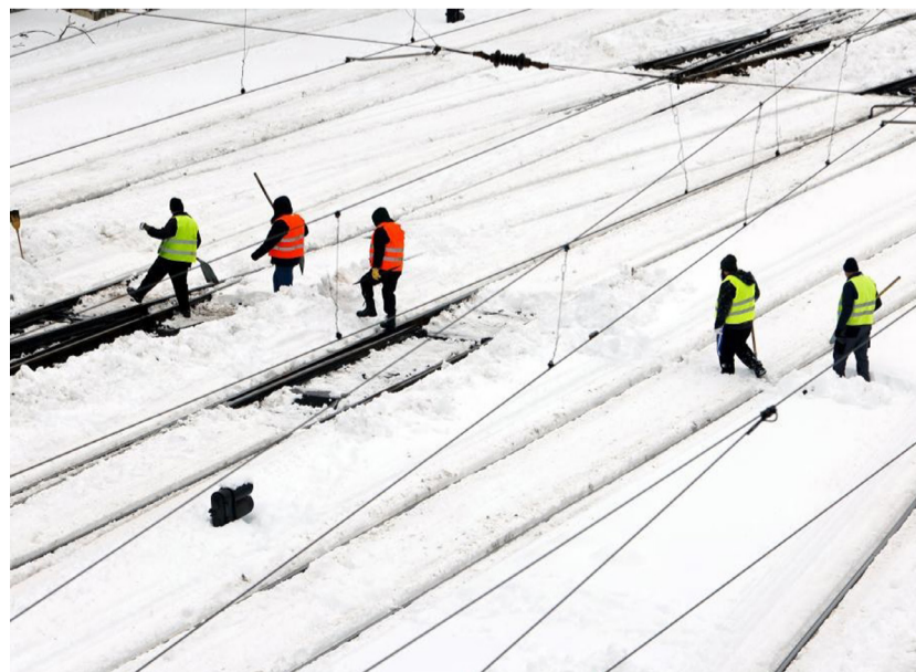
Heavy snow in Romania.