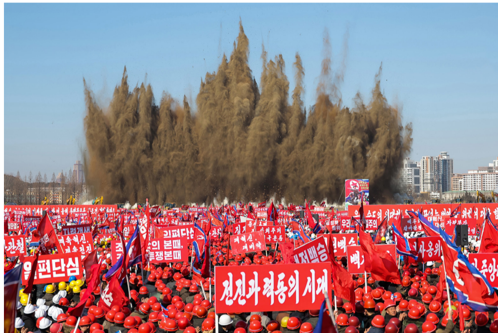
There is a loud sound of defonation signalling the groundbreaking for the fifth-stage construction in the Hwasong area on February 18.

The first step was made in the Hwasong area, a symbol of the civilization of the times, which reflects the far-reaching ideal of the Party and provides a criterion to judge the level of the desired transformation.