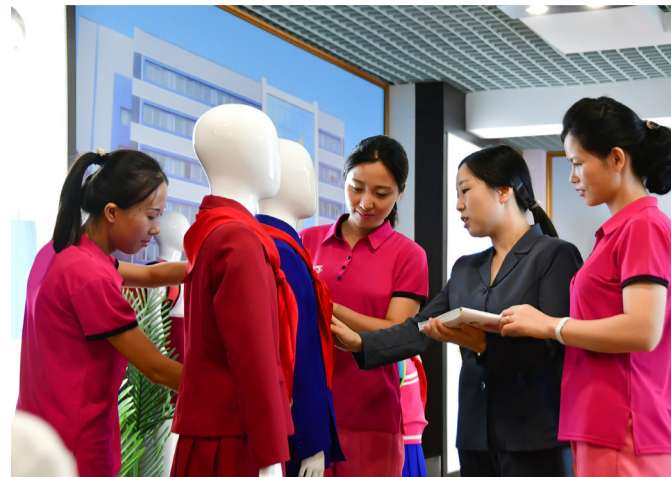
Production is accelerated at the Pyongyang Schoolchildren's Footwear Factory and the Pyongyang School Uniform Factory.