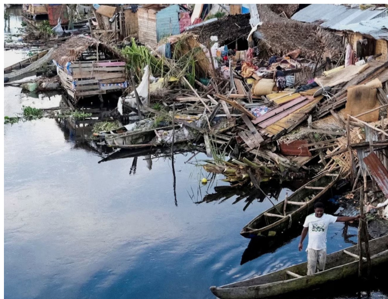
Flood damage in Madagascar.

Experts and international organizations say that the threat to human existence from global warming is no longer an abstract notion and warn that unless the threat is restrained, it might lead to an unpredictable disaster.