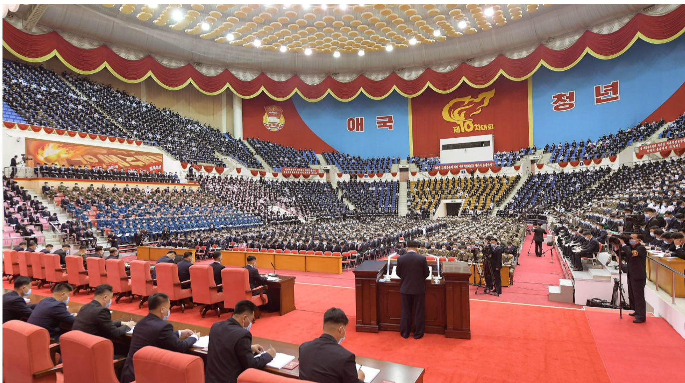
The 10th Congress of the youth league (April 2021).

Under his paternal care the Korean young people proudly selected hard life and training for the prosperity of the country during their youth, not enjoyment and comfort, and grew up to be masters of the times who know how to overcome difficulties, make innovations and carry out their patriotic duties.