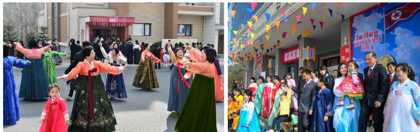
The election of deputies to the 15th Supreme People’s Assembly takes place at constituencies in different areas.